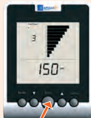
On screen calibration allows the Apollo Smart to be quickly, accurately and reliably calibrated in minutes!